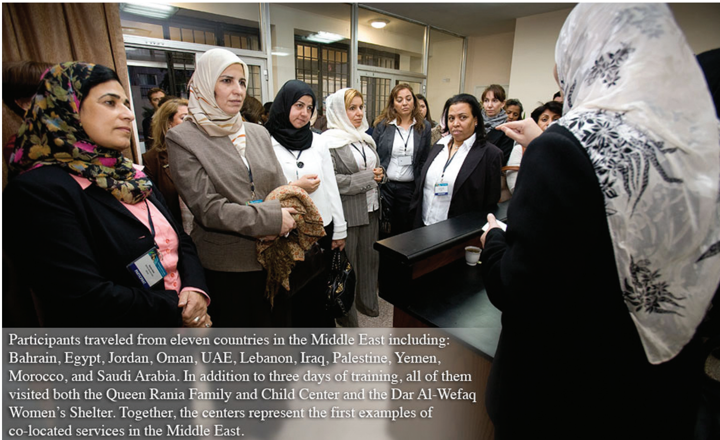
Participants traveled from eleven countries in the Middle East including: Bahrain, Egypt, Jordan, Oman, UAE, Lebanon, Iraq, Palestine, Yemen, Morocco, and Saudi Arabia. In addition to three days of training, all of them visited both the Queen Rania Family and Child Center and the Dar Al-Wefaq Women's Shelter. Together, the centers represent the first examples of co-located services in the Middle East.

to do it: regular reports on a specific program's progress, regular reports on the organization's progress (an annual report is common), invitations to organization programs or events, thank you letters and gifts- photos from events, organization items (pens, t-shirts, notebooks, scarves, books, etc.).